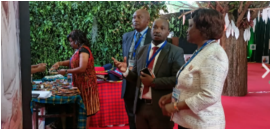
Maasai Mara Climate action activities to participants during the summit